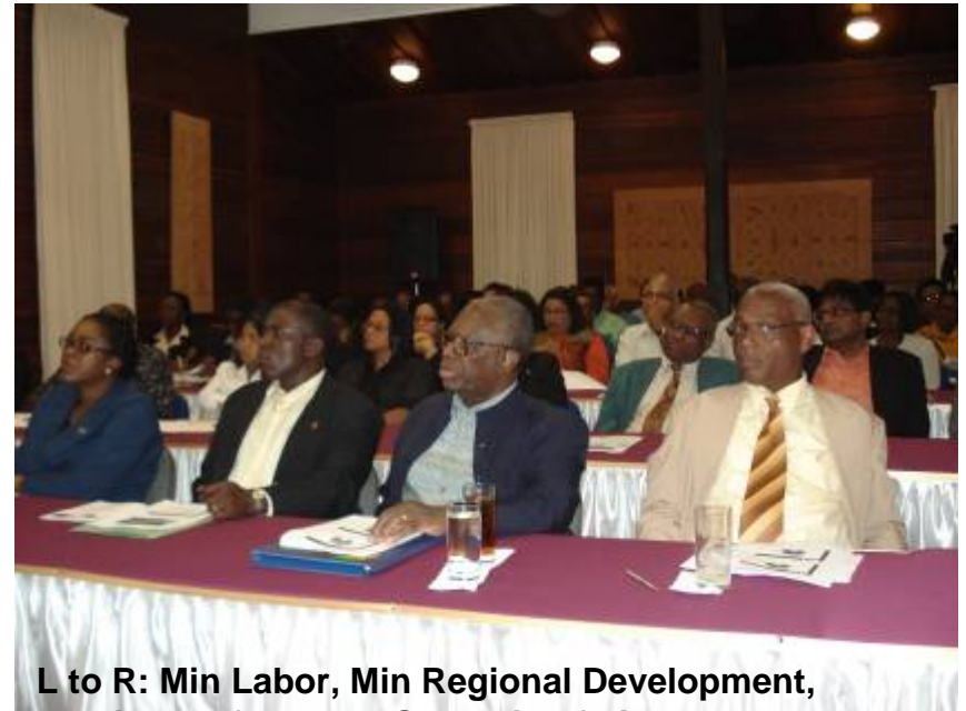
L to R: Min Labor, Min Regional Development, President of the Rep Sur , Min of Finance